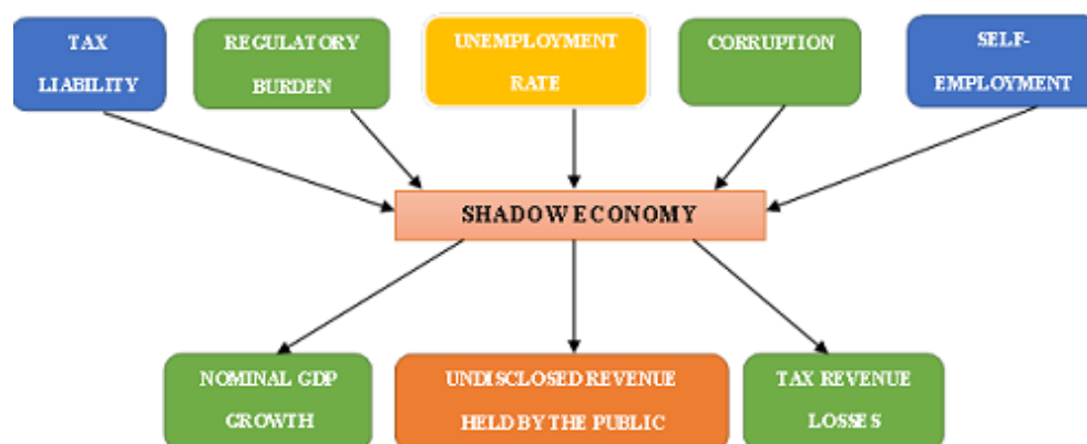
Figure 1 MIMIC approach of measuring shadow economy

Multiple Indicator Multiple Cause (MIMIC) approach takes into consideration the numerous causes of shadow economy as well as the several influences of the informal economy on other areas of the economy. This approach uses both the visible and the discreet variables causing shadow economy and the resultant effects of the informal sector (Abdih & Medina, 2016, Schneider, 2010, Vuletin, 2009). The figure 1 below gives a pictorial illustration of factors causing shadow economy in Nigeria and the effects of the informal sector in the country. From figure 1 below, the MIMIC approach depicts that tax liability, regulatory burden, unemployment rate, corruption and self-employment are major determinants of shadow economy in the country which in turn boosts Nominal GDP growth, gives the public an opportunity to withhold unreported income and causes tax revenue losses for the government. Informal economy output that could be taxable income is considered as tax revenue loss because the informal sector participants or agents equally benefit from the public goods and services provided by the government through tax revenues received from the loyal citizens (Anwar, Akbar, Akbar, & Azhar, 2017).